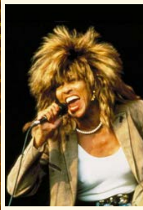
Tina Turner £48.50 11 th December - 7pm