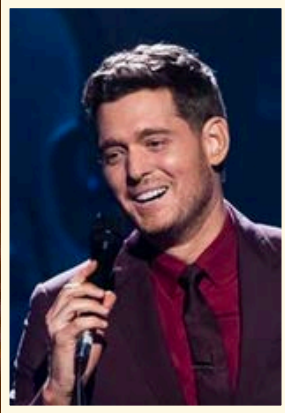
Michael Bublé £48.50 4 th December - 7pm