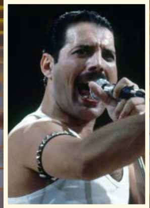
Freddie Mercury £48.50 18 th December - 7pm